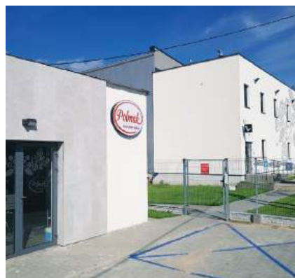
Pol-Mak factory in Ludwinie

POL-MAK also offers pasta for main courses made from durum wheat flour, with eggs in the most imaginative shapes, like hearts or gigli, as well as functional pasta made from whole grain flour and flour blends.